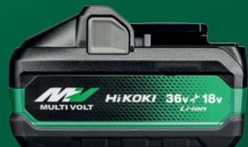
BSL36B18X HIGH OUTPUT BATTERY