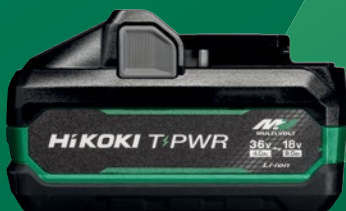
BSL3640MVT HIGH OUTPUT TABLESS BATTERY