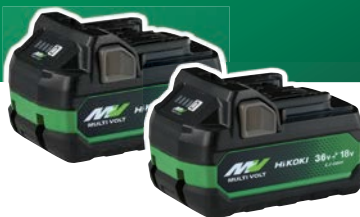
2 x BSL36A18X 18/36V MULTIVOLT BATTERIES

SPEND BETWEEN $999-$1298 ON HIKOKI CORDLESS POWER TOOLS TO REDEEM