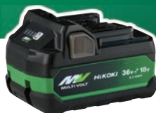
1 x BSL36A18X 18/36V MULTIVOLT BATTERY

SPEND BETWEEN $699-$998 ON HIKOKI CORDLESS POWER TOOLS TO REDEEM