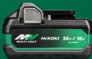
BSL36A18X HIGH OUTPUT BATTERY