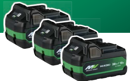
3 x BSL36A18X 18/36V MULTIVOLT BATTERIES

SPEND $1299 OR OVER ON HIKOKI CORDLESS POWER TOOLS TO REDEEM